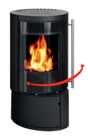
ROTATING UPPER BODY OF THE STOVE